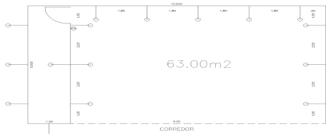
STAND MODELO DE 63.00 M2 IZQUIERDO. (PUEDE SER DERECHO SEGUN LOCALIZACION)

13 SPOTS PARA STAND MEDIANERO Y 16 PARA STAND ESQUINERO 20 ML DE PERIMETRO INTERNO POR 3.66 MTS DE ALTURA (NO INCLUYE 1 ML DE PUERTA) 1.50 ML DE PERIMETRO EXTERNO ADICIONAL POR 3.66 MTS DE ALTURA PARA STAND MEDIANERO 7.50 ML DE PERIMETRO EXTERNO ADICIONAL POR 3.66 MTS DE ALTURA PARA STAND ESQUINERO —○ SPOT BRAZO SENCILLO EXTENDIBLE, BOMBILLA HALOGENA DE 150 WATTS / 110V ⊙ TOMACORRIENTE DOBLE 1500 WATTS / 110V